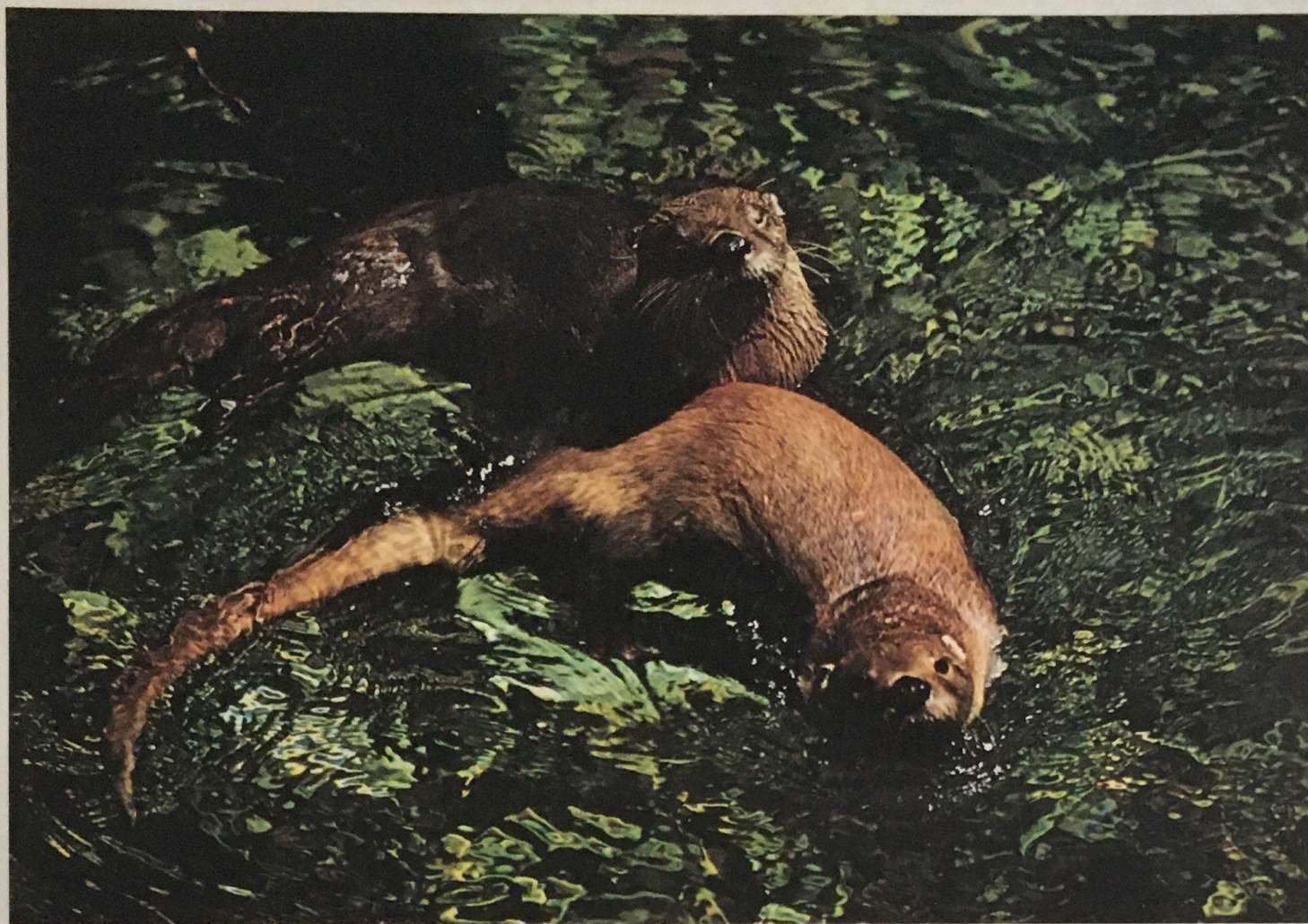
River otters.