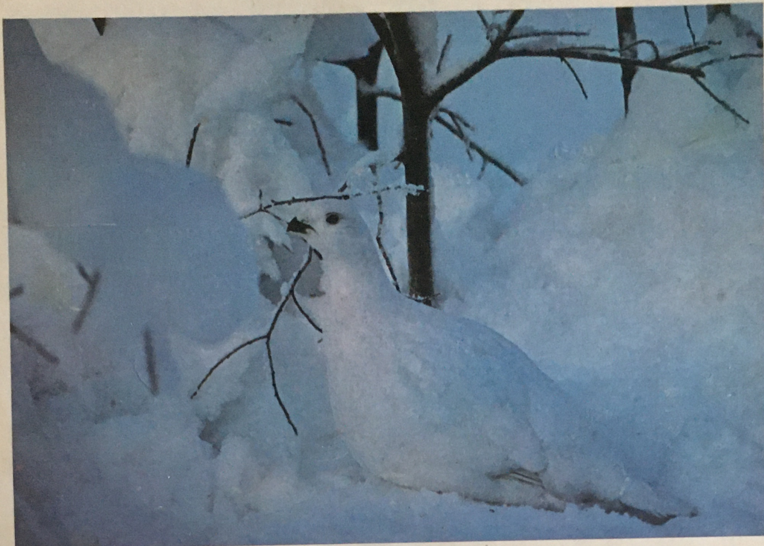
Willow ptarmigan.