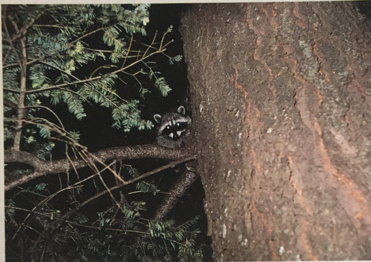
Raccoon. By Tom Myers.