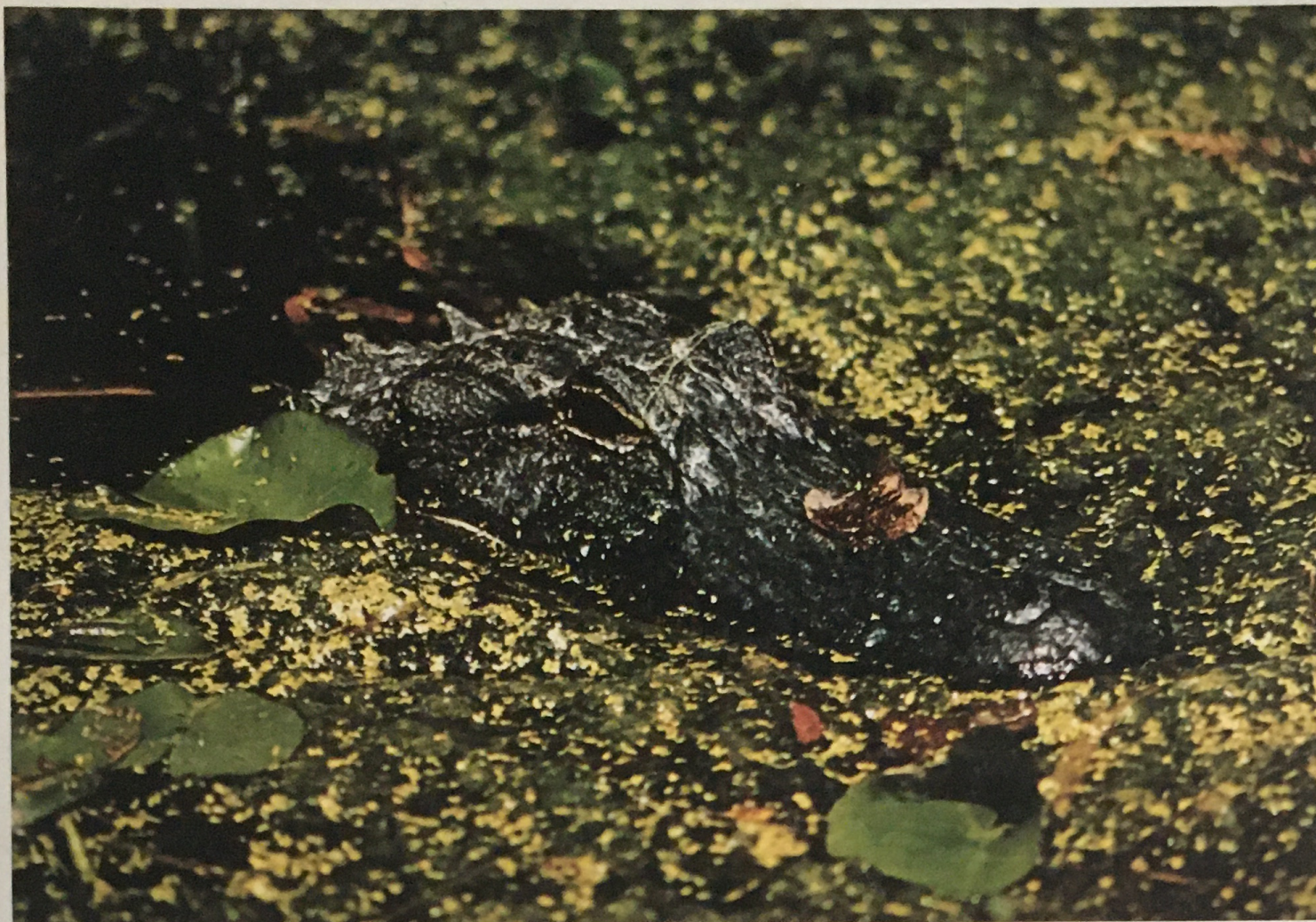
Alligator. By Les Line.