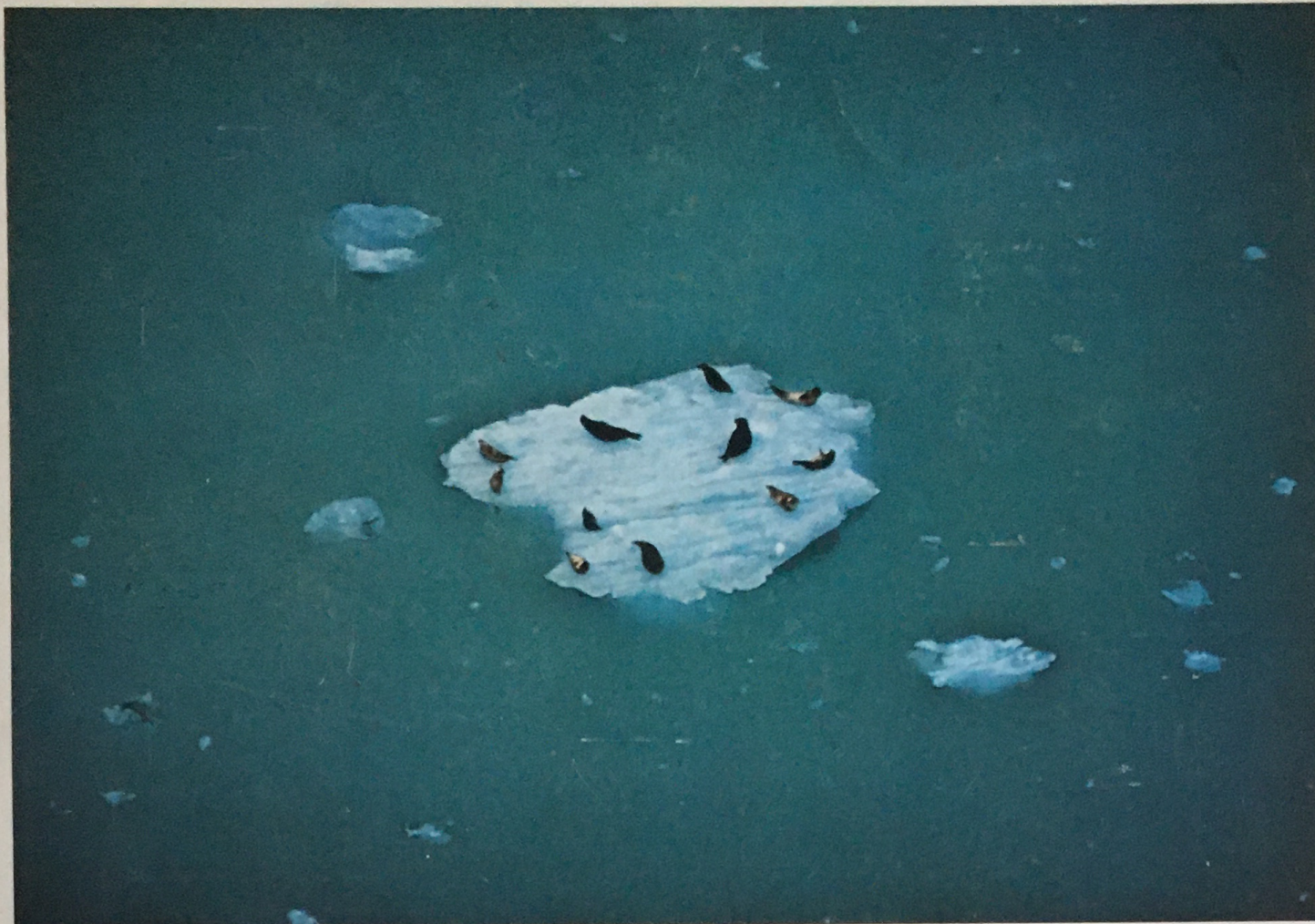
Seals.