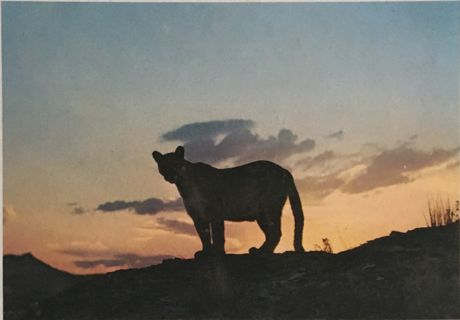
Mountain Lion.