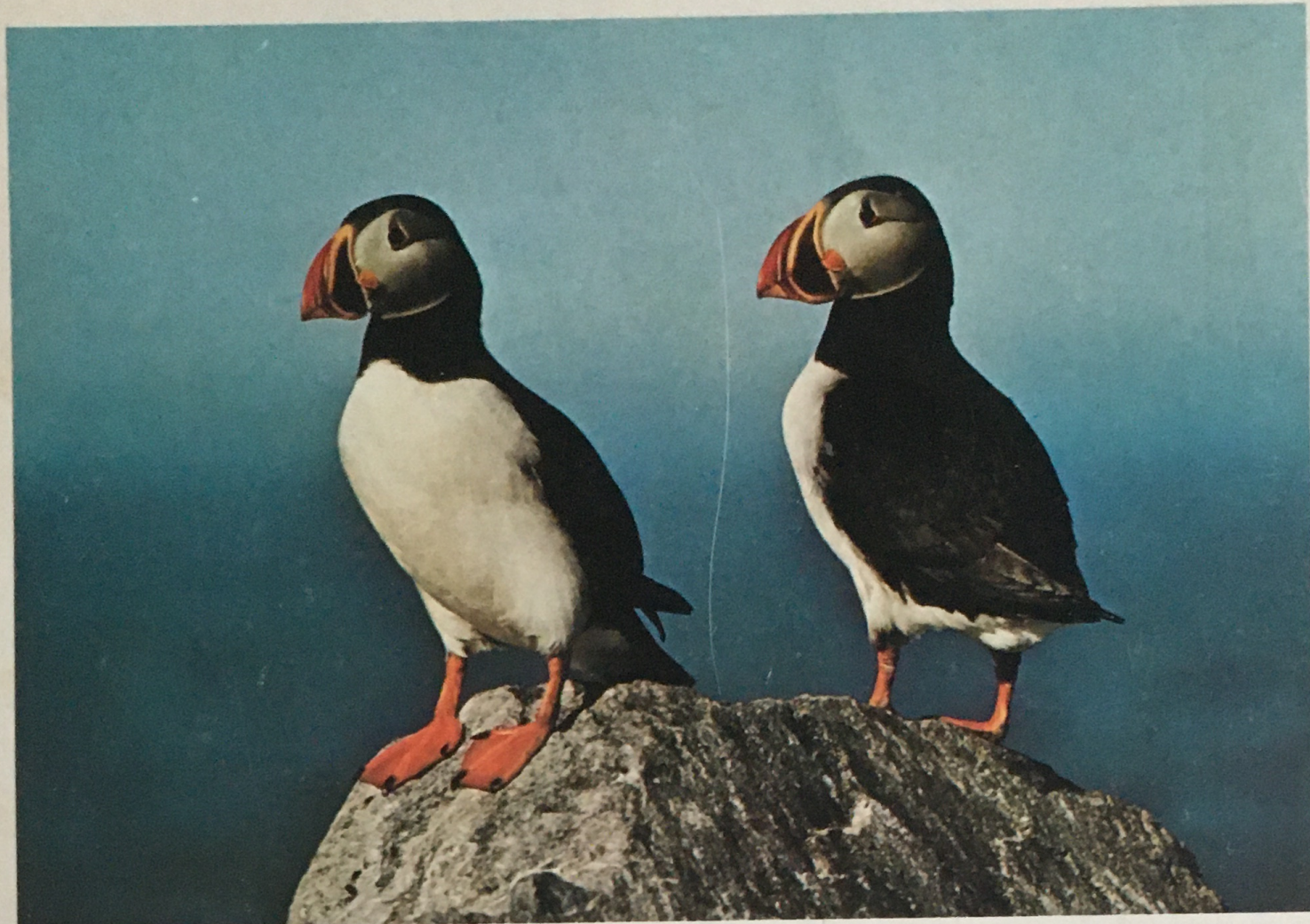
Puffin. By Les Line.