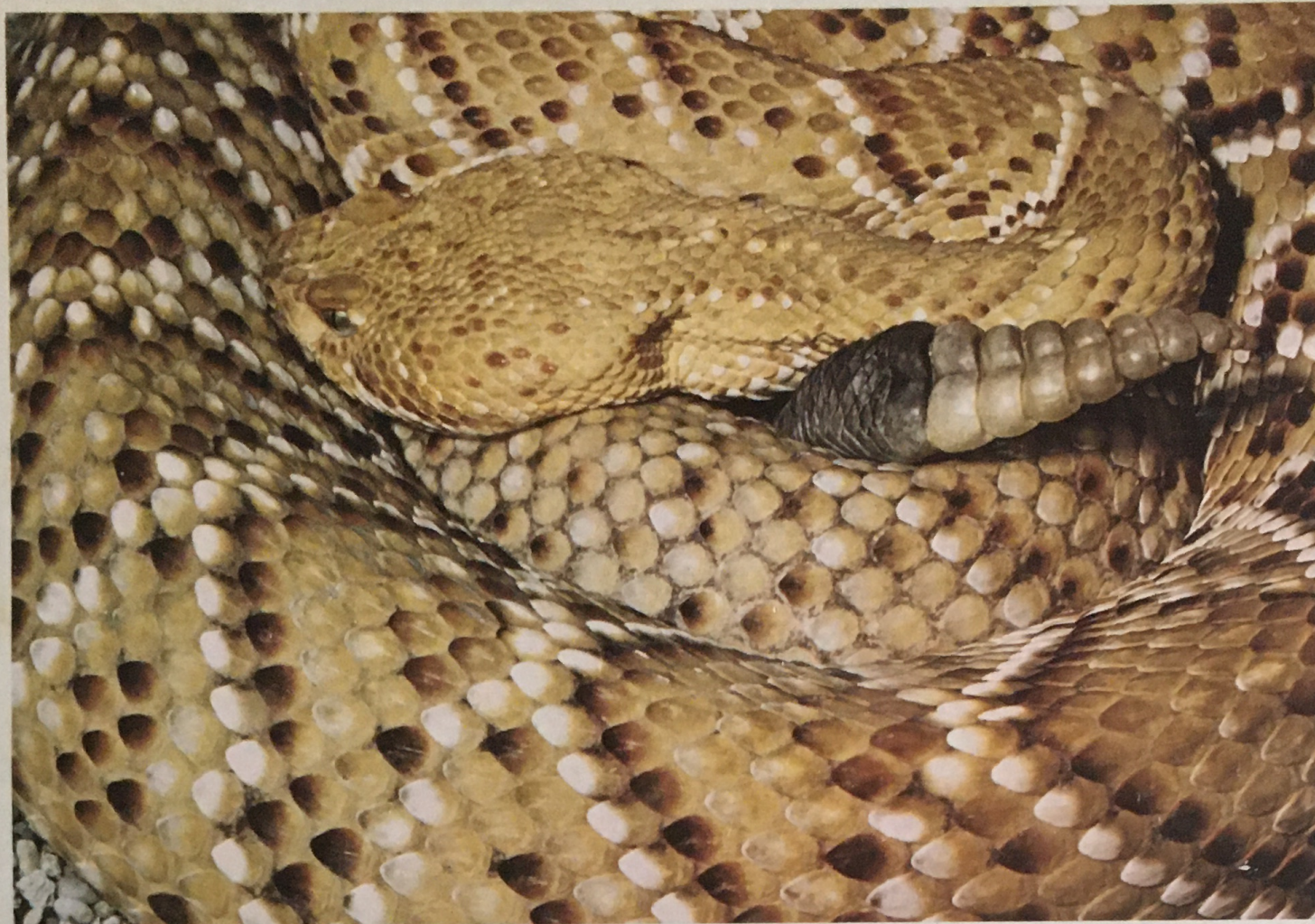
Rattlesnake. By Tom Myers.