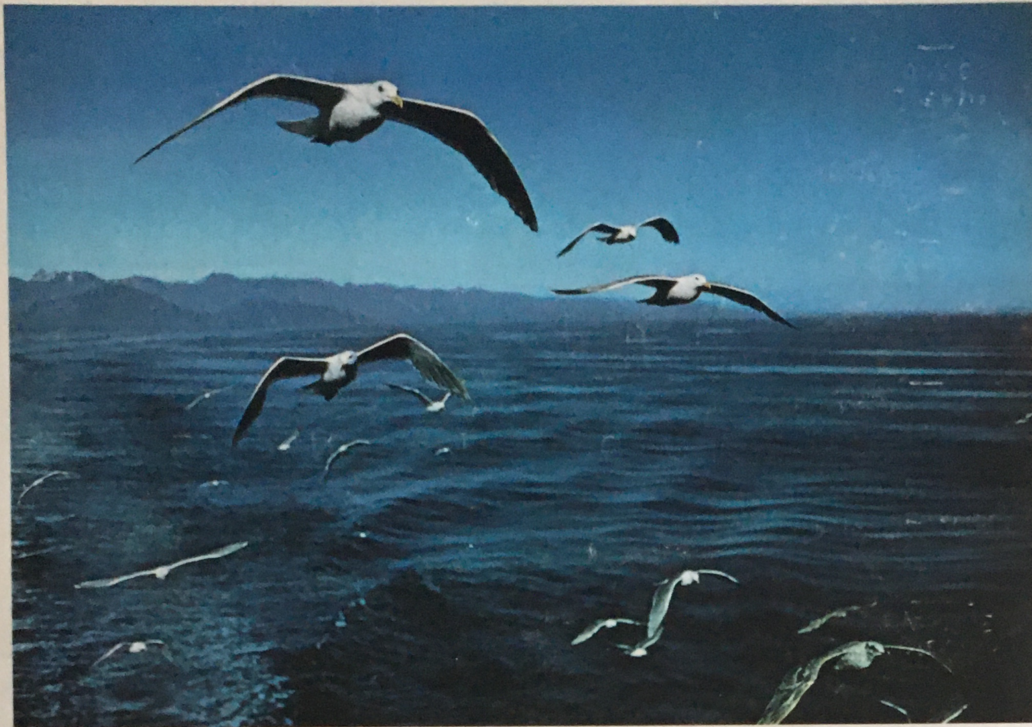
Seagulls. By Olaf Sööt.