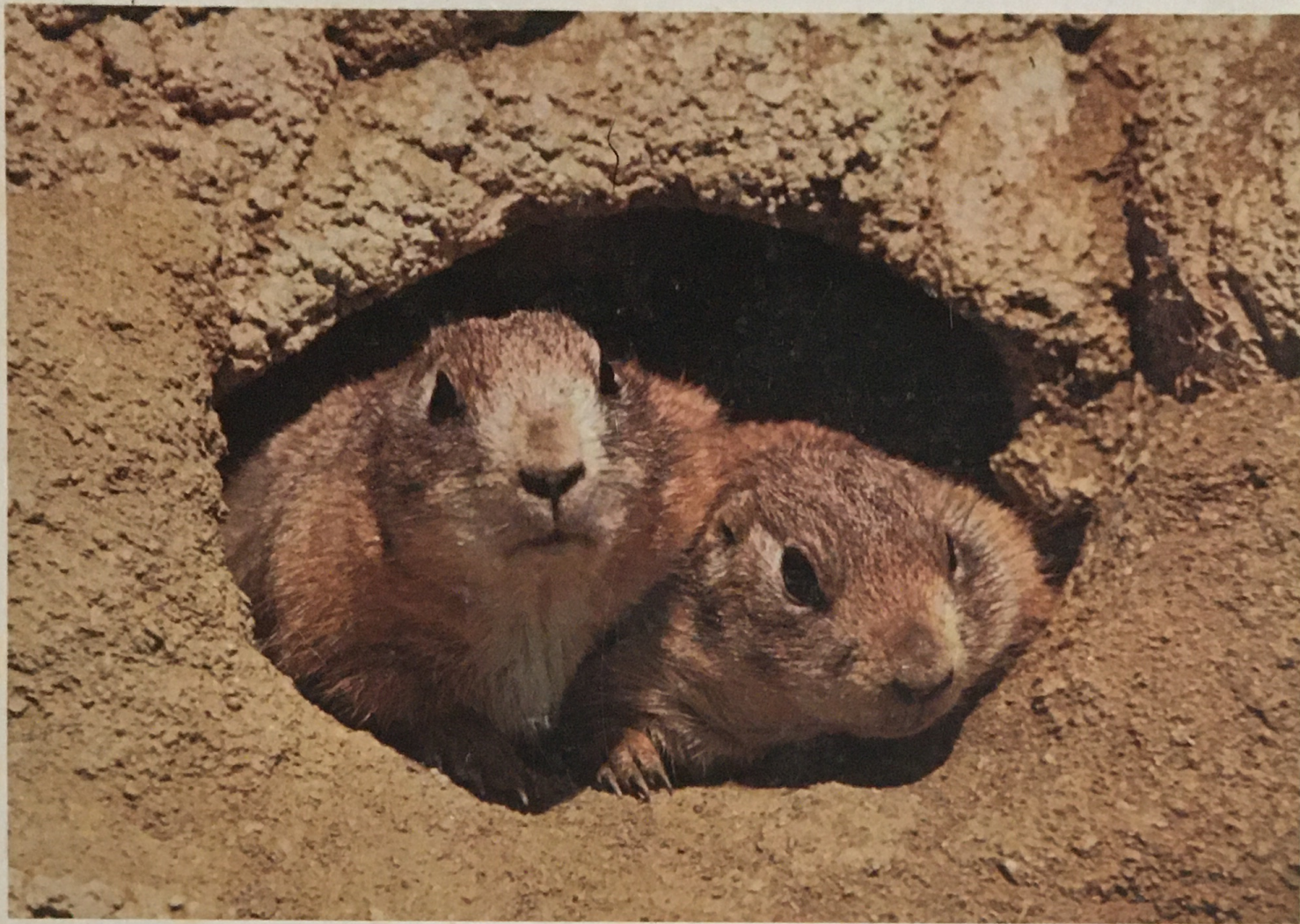
Prairie dogs.