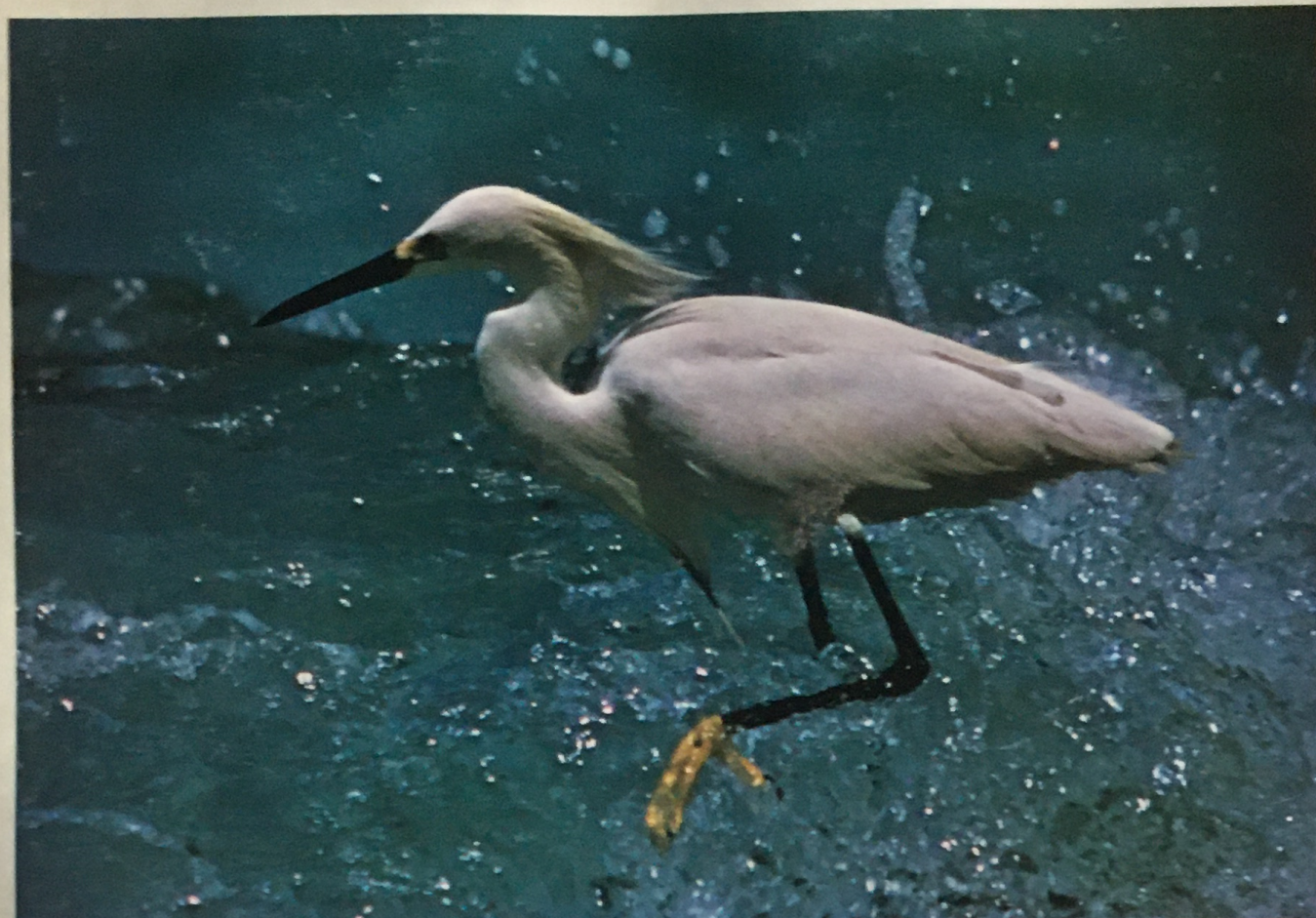
Snowy Egret, Lee County, Florida.