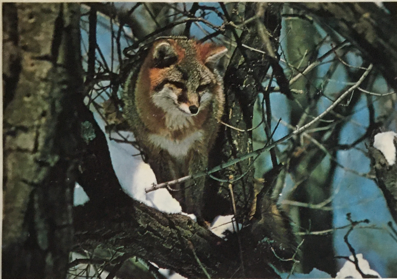
Gray Fox, New Jersey.