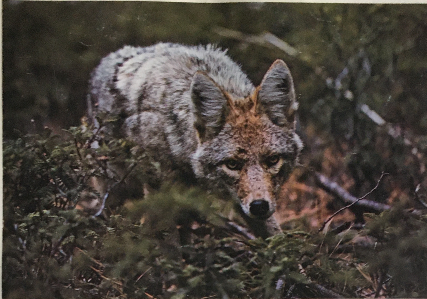
Coyote, Yosemite National Park, California.