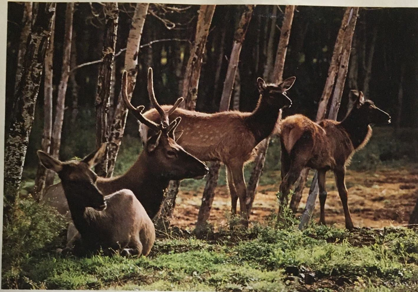
American Elk, Alberta.