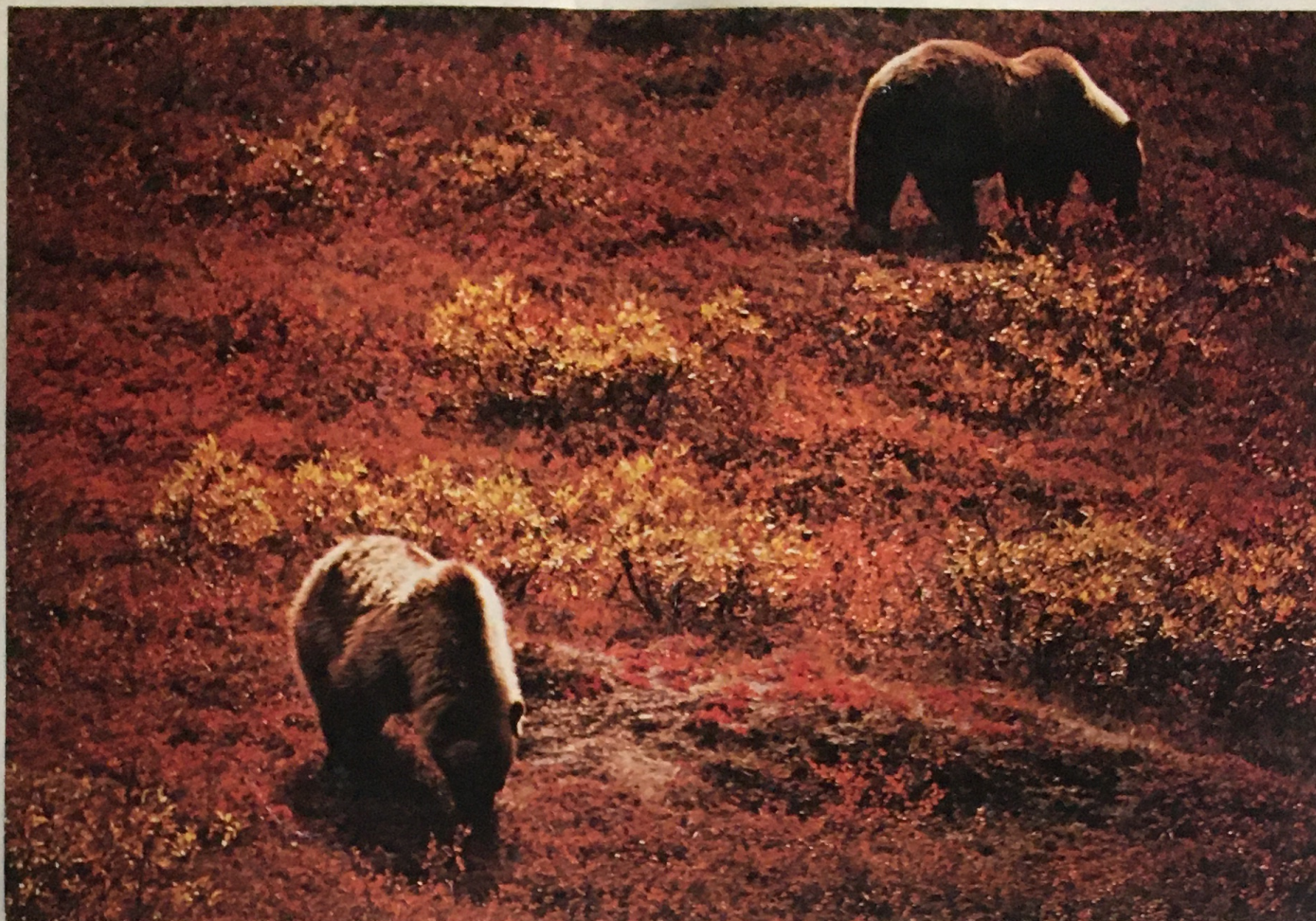
Grizzly cubs, Mt. McKinley National Park, Alaska.