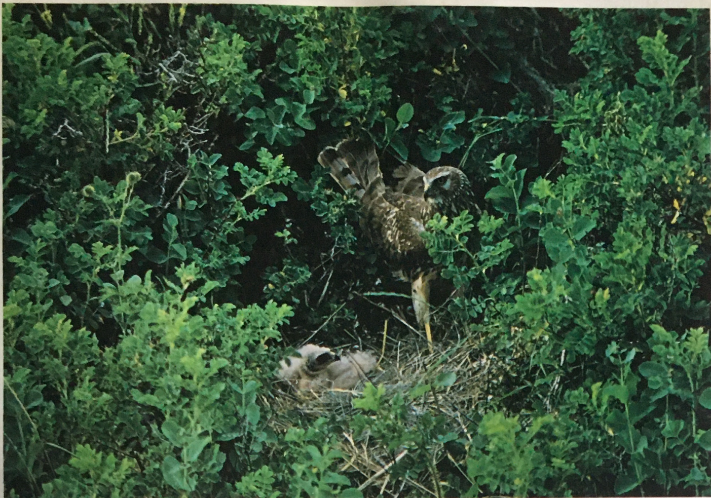
Marsh Hawk, Montana.