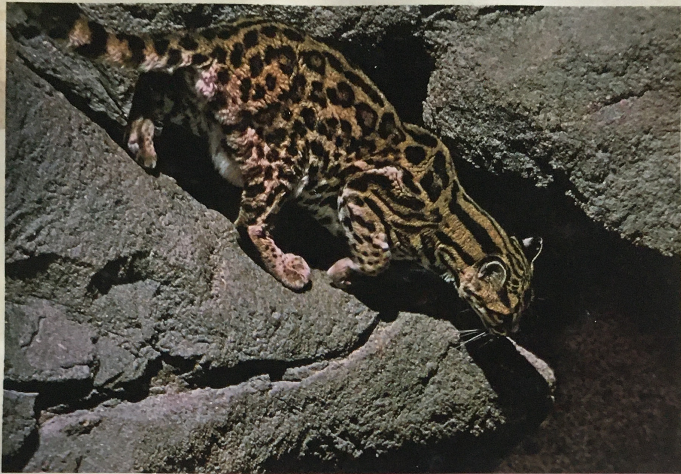
Margay, Arizona.