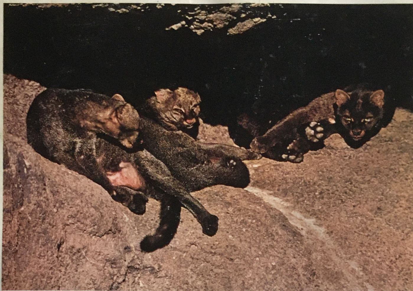
Jaguarundi, Arizona.