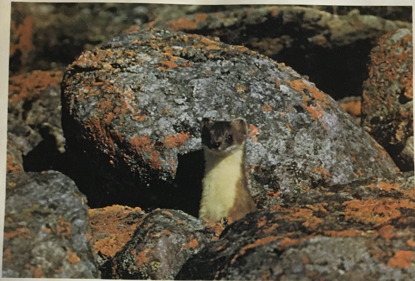
Short-tailed Weasel near den, Victoria Island, Northwest Territory.