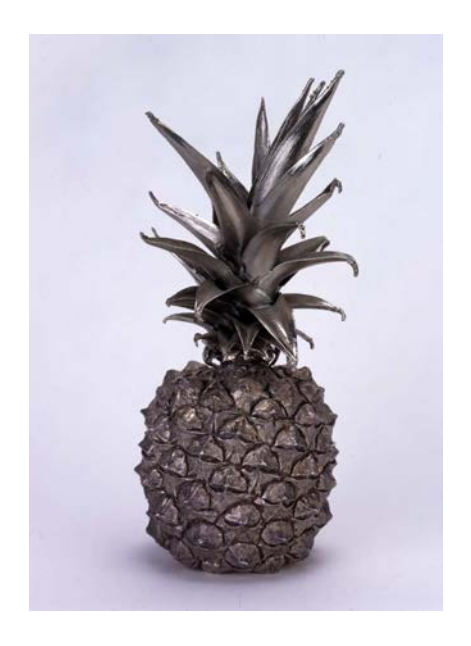
Robert Rauschenberg Untitled (cast pineapple), 2004 Silver 9 x 5 x 4 inches (22.9 x 12.7 x 10.2 cm) Robert Rauschenberg Foundation