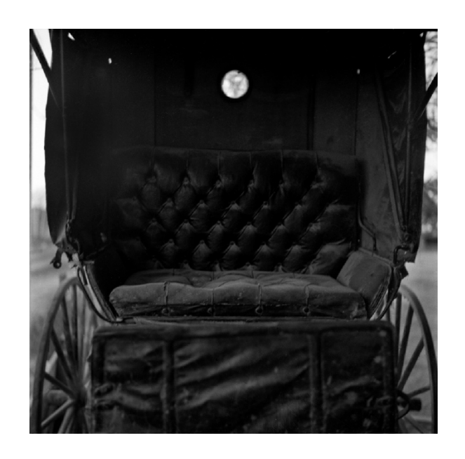
Robert Rauschenberg Untitled (Interior of an Old Carriage), 1949 Gelatin silver print 10 1/8 x 9 5/8 inches (25.7 x 24.4 cm) image size The Museum of Modern Art, New York Nelson A. Rockefeller Fund