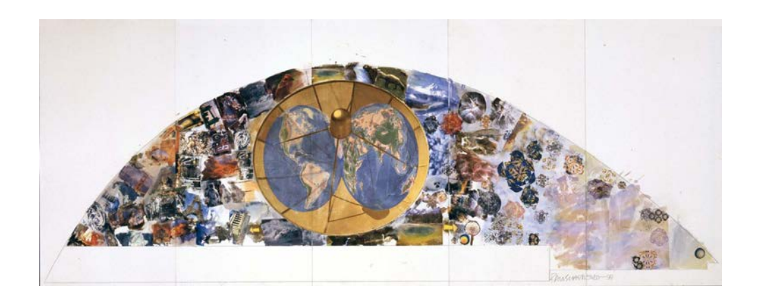
Robert Rauschenberg The Happy Apocalypse [original artwork for Padre Pio Liturgical Hall], 1999 Inkjet pigment transfer, acrylic, and graphite on polylaminate 96 x 250 1/16 x 2 inches (243.8 x 635.2 x 5.1 cm) The Menil Collection, Houston Gift of the artist in memory of Walter Hopps

Q: Had he, would it have been your job to try to determine the value of something?