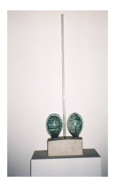
Robert Rauschenberg The Man with Two Souls , 1950 Two green glass wine bottles (one containing a twig, the other an arrowhead) and glass rod mounted in plaster 47 1/4 x 7 7/8 x 5 1/2 inches (120 x 20 x 14 cm) Private collection, Rome

moment and be more related to that and is not the work on the Betty Parsons checklist. In which case we still now need to find The Man with Two Souls . If in fact it is a painting and not the sculpture that we know now by that title. This is the evolution of research.