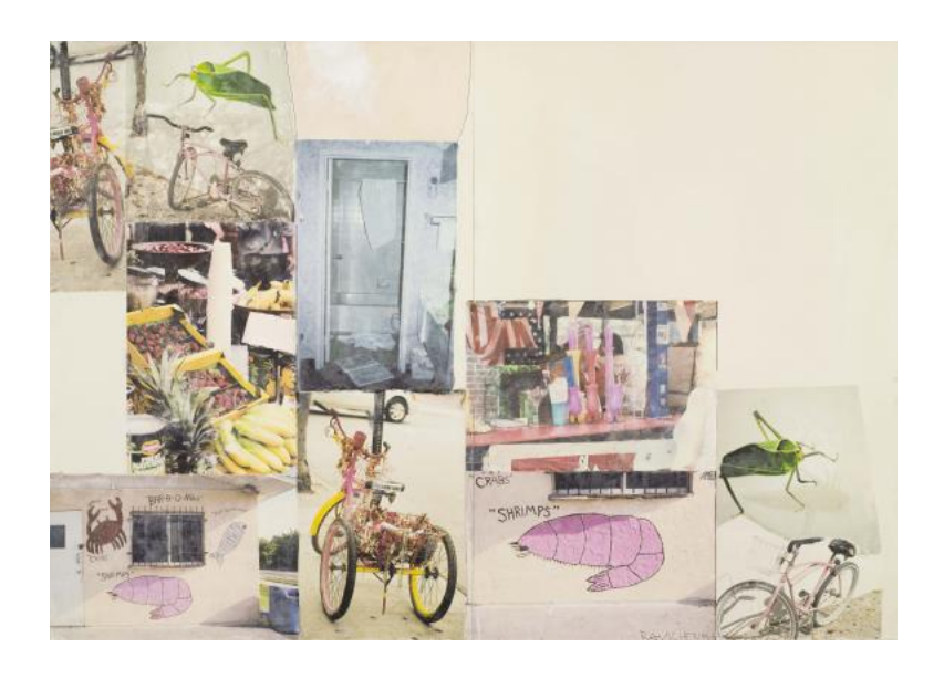
Robert Rauschenberg Catydid Express (Scenario) , 2002 Inkjet pigment transfer, acrylic, and graphite on polylaminate 85 1/2 x 120 1/2 inches (217.2 x 306.1 cm) Collection Faurschou Foundation

Here was a wonderful Scenario work [series 2002–06] called Catydid Express [(Scenario), 2002] with the images of the shrimp and the bicycles. Yes.