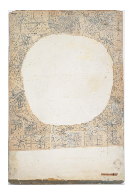
Robert Rauschenberg Mother of God , ca. 1950 Oil, enamel, printed maps, newspaper, and metallic paints on Masonite 48 x 32 1/8 inches (121.9 x 81.6 cm) San Francisco Museum of Modern Art Fractional purchase through a gift of Phyllis Wattis and promised gift of an anonymous donor

Q: Okay and for example? So, at the time is there a specific example that you can speak about, how you had limited information then and now you have more?