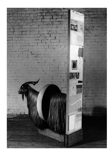
Second state of Rauschenberg's Monogram (1955–59; second state 1956–58) in his Pearl Street studio, New York, ca. 1958.