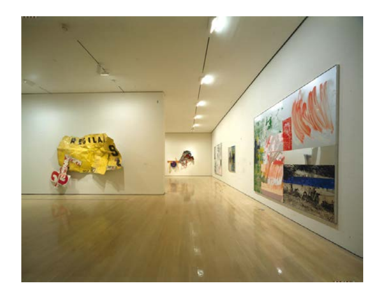
Installation view, Robert Rauschenberg: A Retrospective, Guggenheim Museum SoHo, New York, 1997–98. Works shown are Regilar Diary Glut (1986), Greek Toy Glut (Neapolitan) (1987), Easter Lake (Galvanic Suite) (1988), Luxer (Urban Bourbon) (1988), and Master Pasture (Urban Bourbon) (1989) Photograph Collection. Robert Rauschenberg Foundation Archives, New York.

Night Shades [1991], all of these works and into the more print transfer works that he had started in the early nineties.