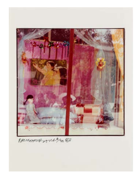
Robert Rauschenberg Study for Chinese Summerhall (Pink Window), 1983 Chromogenic print 40 x 30 inches (101.6 x 76.2 cm) Robert Rauschenberg Foundation

Davidson: Right and understanding it and interpreting it in a way. I wasn't looking at it just as a book project. I wanted him to make prints of these images just like he'd done with the early fifties material. They're done in 20-by-16-inch formats. He'd only ever printed two other color projects, the Chinese Summerhall [1982] and—actually I think it was just the Chinese Summerhall , the only color photographs that he chose as fine art work. [Note: In addition to the 100-foot chromogenic print Chinese Summerhall , there are two related portfolios of individual images both titled Study for Chinese Summerhall, both 1983, and a series of excerpts from the 100-foot print titled Studies for Chinese Summerhall , 1984. In 1987 Rauschenberg completed a series of Polacolor prints.] It was just to try to engage him with a different series—but anyway it didn't happen.