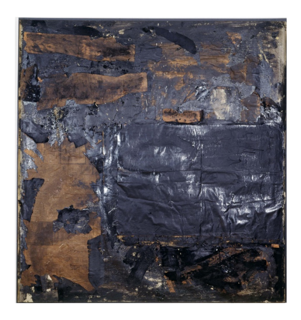
Robert Rauschenberg Untitled [black painting with portal form], 1952–53 Oil and newspaper on canvas 51 1/8 x 54 1/4 inches (129.9 x 137.8 cm) San Francisco Museum of Modern Art Promised gift of anonymous donor

Davidson: Well, it must have been in that spring or summer. I remember going to Washington to see the show and really studying all the art and looking at the black paintings [1951–53]. That's when I first started realizing you could read dates in some of the newspaper materials so I started recording all of that. I must have been there for the de-install because I remember taking measurements and that kind of work. Then I would've come back to Houston and we sat down and for the next four months produced the catalogue.