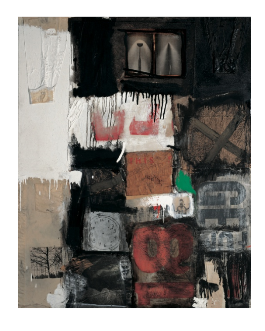
Robert Rauschenberg Migration , 1959 Combine: oil, paper, printed paper, printed reproductions, photographs, fabric and wood on canvas 50 x 40 inches (127 x 101.6 cm) Herbert F. Johnson Museum of Art, Cornell University, Ithaca, New York Anonymous gift