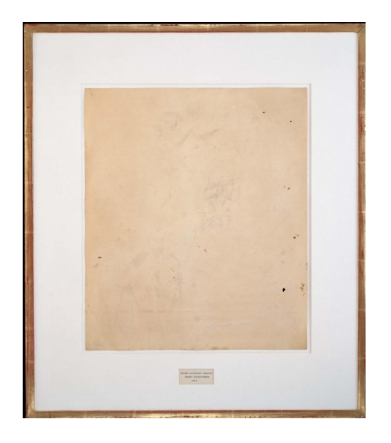
Robert Rauschenberg, Erased de Kooning Drawing, 1953 Traces of ink and crayon on paper, with mat and handlettered label in ink, in gold-leafed frame 25 1/4 x 21 3/4 x 1/2 inches (64.1 x 55.2 x 1.3 cm) San Francisco Museum of Modern Art Purchase through a gift of Phyllis Wattis

Davidson: It was maybe twelve or thirteen. Erased de Kooning Drawing [1953] was one of them. I do remember when the sheriffs came in to take the things, that was what I was trying to do before they came in, direct them to things that weren't so fragile, that were glazed, and that would still meet the value that they needed. I was also trying not to upset the exhibition too much because we had to paper over the whole thing rather quickly. It was absolutely insane.