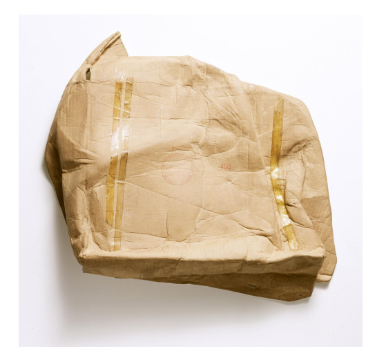
Robert Rauschenberg Tampa Clay Piece 3 , 1972–73 Fired and glazed ceramic with tape and silkscreened decal 19 1/2 x 24 x 5 1/2 inches (49.5 x 61 x 14 cm) From an edition of 10 Roman numerals and 10 Arabic numerals, published by Graphicstudio, University of South Florida, Tampa

Elliott: Well, the Tampa Clay Pieces were trompe l'œil crushed cardboard boxes; they had labels on them and little staples. They were very "fool the eye." Looking at them, you would have thought they were crumpled cardboard boxes, but they were clay ceramics.