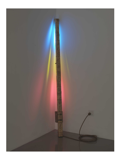
Robert Rauschenberg Bamhue / ROCI JAPAN, 1987 Bamboo with neon, electrical timer, and metal fixtures 90 x 4 x 10 3/4 inches (228.6 x 10.2 x 27.3 cm) From an edition of 25 published by Graphicstudio, University of South Florida, Tampa; only 12 realized