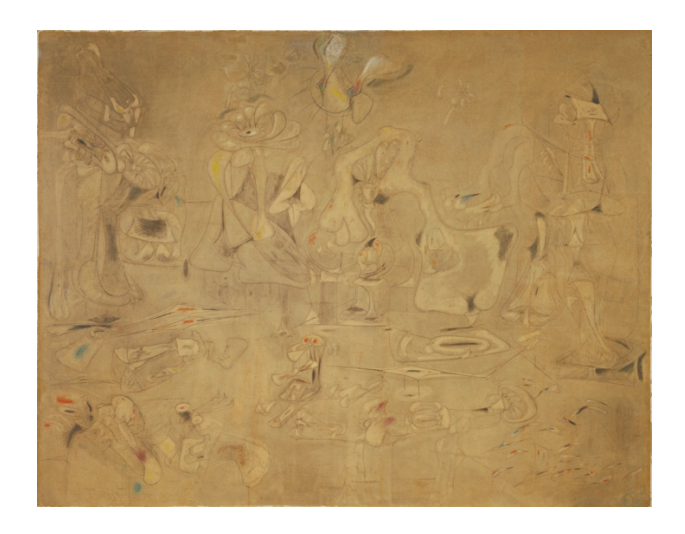
Arshile Gorky Summation , 1947 Pencil, pastel, and charcoal on buff paper mounted on composition board 79 5/8 x 101 3/4 inches (202.1 x 258.2 cm) The Museum of Modern Art, New York Nina and Gordon Bunshaft Fund © 2017 Estate of Arshile Gorky / Artists Rights Society (ARS), New York

because it's really a very great drawing. But Gorky was never like Pollock, somebody who really accrued a tremendous interest.