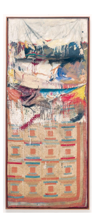
Robert Rauschenberg Bed , 1955 Combine: oil and pencil on pillow, quilt, and sheet, mounted on wood support 75 1/4 x 31 1/2 x 8 inches (191.1 x 80 x 20.3 cm) The Museum of Modern Art, New York Gift of Leo Castelli in honor of Alfred H. Barr Jr.