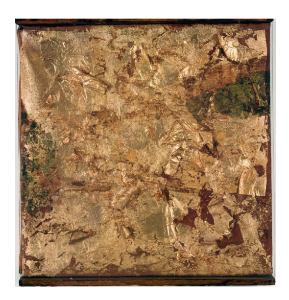
Robert Rauschenberg Gold Painting, 1953 Gold leaf on canvas 10 5/8 x 10 1/8 x 1 3/8 inches (27 x 25.7 x 3.5 cm) Private collection