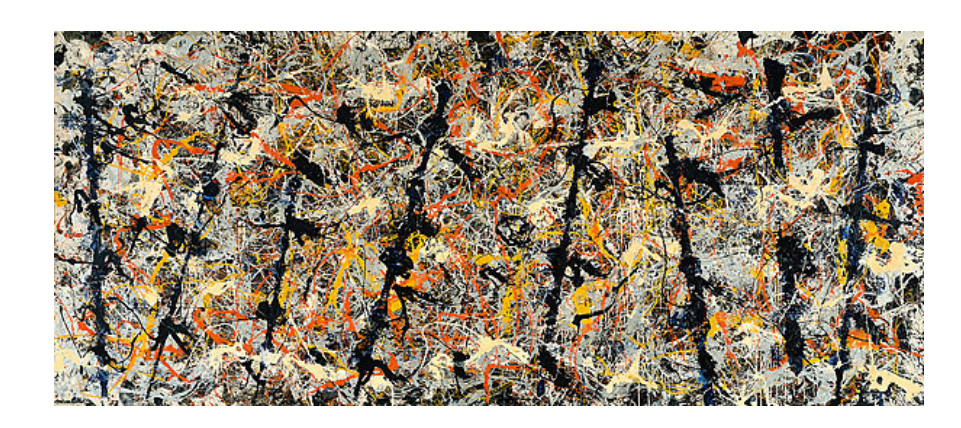
Jackson Pollock Blue Poles [Number 11, 1952], 1952 Enamel and aluminum paint with glass on canvas 83 1/2 x 192 1/2 inches (212.1 x 488.9 cm) National Gallery of Australia Purchased 1973

But she pushed for that. She knew that I could have gotten that. But the bank just said no, that I couldn't do that. So I didn't. It was both good and bad. Some of those pieces I still would long to have. A lot of them are in the Modern; Echo[: Number 25, 1951, 1951] and One[: Number 31, 1950, 1950] [note: both by Pollock] were in that collection and the big Newman painting, Victor or Hercules [ Vir Heroicus Sublimus, 1950–51]. I don't know the name of it, but it's a grand picture that is always up in the collections. There was one that I especially loved, [Arshile] Gorky. I liked his work very much and in this collection was the last work by Gorky, which was a large drawing that is also in the collection of MoMA and really a very dark and complicated big drawing [ Summation, 1947]. I just loved that and wanted to give it to the Cleveland Museum. I asked Sherman if he would pay for part of it because at that point I really thought you shouldn't just give something because it doesn't make them want it unless they participate in it. That was sort of the last time I tried that. Most of the time now I always just give it. He came back and said, "Look, I've never had anything turned down by the acquisitions committee. This is going to be turned down and I don't want to do it. So we won't take it." I thought it was really too bad