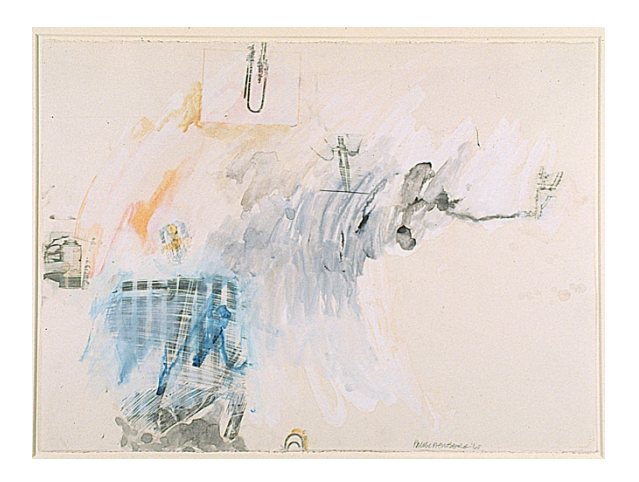
Robert Rauschenberg Untitled, 1969 Solvent transfer and watercolor on paper 22 1/4 x 29 3/4 inches (56.5 x 75.6 cm) Private Collection

I have this wonderful small piece besides the gold piece that's a letter to Christopher Rauschenberg, upside-down [Untitled, 1960]. It's sort of a collage piece. It's really nice.