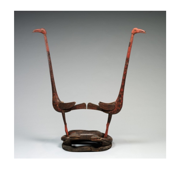
Unknown Artists Cranes and Serpents , 475–221 BCE Lacquered wood with polychromy 52 x 49 inches (132.1 x 124.5 cm) The Cleveland Museum of Art Purchase from the J. H. Wade Fund

The Cleveland Museum of Art Leonard C. Hanna, Jr. Fund