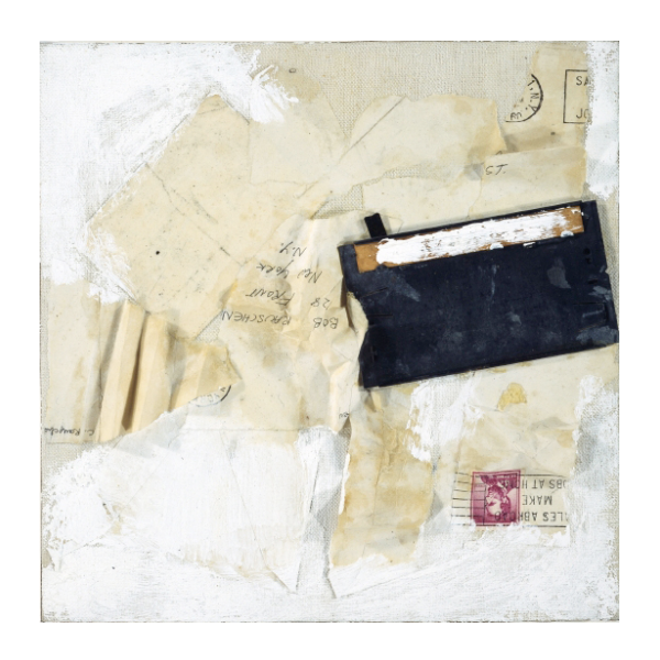
Robert Rauschenberg Untitled , 1960 Combine: oil, paper, and metal on canvas 8 1/2 x 8 1/2 inches (21.6 x 21.6 cm) Private Collection

I have this wonderful small piece besides the gold piece that's a letter to Christopher Rauschenberg, upside-down [Untitled, 1960]. It's sort of a collage piece. It's really nice.