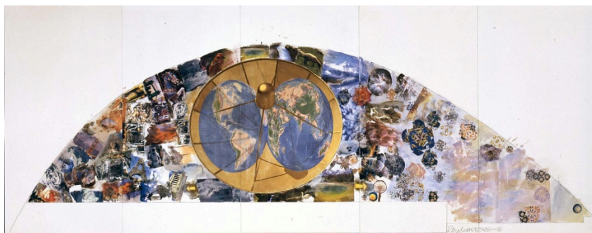
Robert Rauschenberg The Happy Apocalypse [original artwork for Padre Pio Liturgical Hall], 1999 Inkjet pigment transfer, acrylic, and graphite on polylaminate 96 x 250 1/16 x 2 inches (243.8 x 635.2 x 5.1 cm) The Menil Collection, Houston Gift of the artist in memory of Walter Hopps

brain. Anyways, the design was that Bob had to—he was going to tell the story of the Bible from his eyes, like Michelangelo. [Note: The Happy Apocalypse , 1999] Bob studied the Bible. Again, he wanted to be a preacher. But, so he's dyslexic. It took him—I remember three weeks when the Bible was always on the counter and he's— I'll never forget one day. He comes over and I came in. "How you doing?" "I'm doing shitty!" I go, "Whoa, what's up? What's going on?" I'm thinking something's wrong with the property. He goes, "Have you read this?" And he holds the Bible to me and I go, "Well, what I'm supposed to have read as a kid, growing up a good Lutheran." He said, "It's mean to women. It's mean to animals." Just on and on and on.