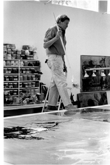
Rauschenberg working on Grand Slam (Galvanic Suite) (1990) in his Laika Lane studio, Captiva, Florida, 1990.