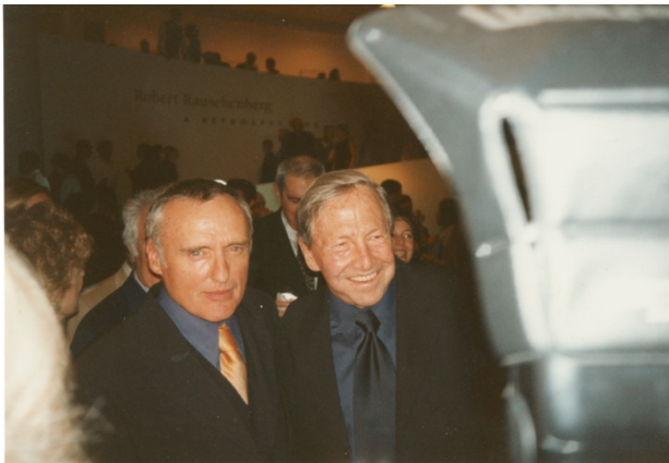
Dennis Hopper and Rauschenberg at the opening of Robert Rauschenberg: A Retrospective, Solomon R. Guggenheim Museum, New York, September 1997.

staff, we would always just be looking because if he caught your eye, he'd give you a little nod, and that's when we would circle the wagons, if you will, where we would just circle him and give him a moment—glass of water, glass of wine, glass of Jack Daniel's, whatever the case may be at the time, just to give him a moment to breathe. I always thought that was amazing because it was never something that we rehearsed or it was never something he asked us to do. I think it was just that care. That we always were looking out for him and the same thing for him, looking out for us. That was my first real eye-opening art experience with Bob.