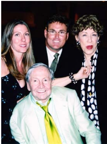
Rauschenberg with Lily Tomlin (right) and others, 2002