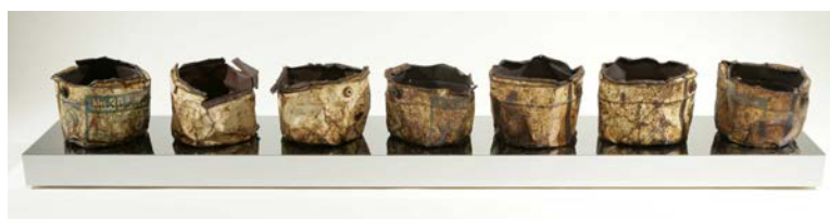
Robert Rauschenberg Watchdog , 2007 Rusted metal buckets on mirrored aluminum composite base 13 x 96 x 14 inches (33 x 243.8 x 35.6 cm) Robert Rauschenberg Foundation