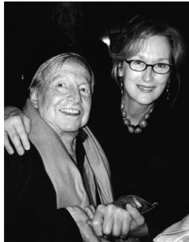
Rauschenberg and Meryl Streep, 2005.

Interested and engaged when they're talking to you. There've been people here like yes, okay.