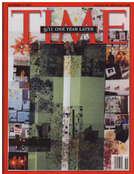
Robert Rauschenberg Cover for Time magazine, September 11 commemorative issue, 2002 10 1/2 x 8 inches (26.7 x 20.3 cm)

everybody, obviously, but he was—he was pretty pissed off about that whole thing. That’s the best way to say it. Yes.