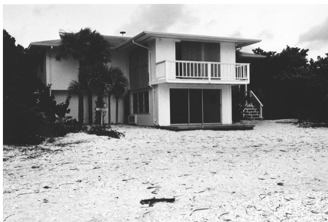
Rauschenberg's Beach House, Captiva, Florida, ca. 1971. Photograph Collection. Robert Rauschenberg Foundation Archives, New York.

Actually, it's a three-bedroom place and it had a downstairs that he enclosed that became his first studio in Florida. Just literally from day one—again, very similar to me—came over the bridge, knew that this is probably the place I want to be. It's just absolutely fantastic.