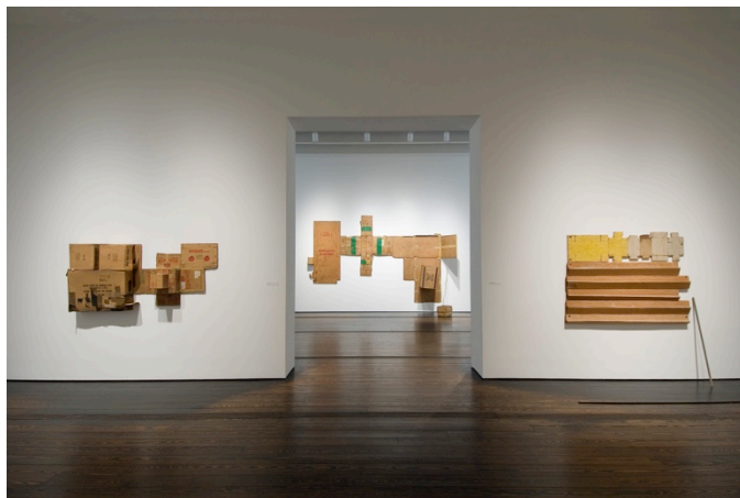
Installation view, Robert Rauschenberg: Cardboards and Related Pieces , The Menil Collection, Houston, 2007. Works pictured: Rosalie / Red Cheek / Temporary Letter / Stock (Cardboard) , Glass / Channel / Via Panama (Cardboard) , and Canary Stick (Cardboard) (all 1971)