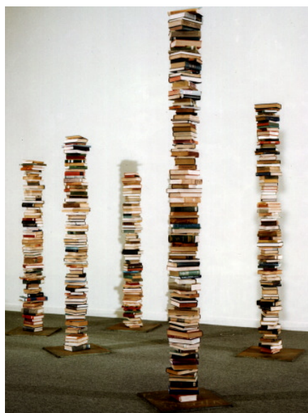
Robert Rauschenberg The 1/4 Mile or 2 Furlong Piece , 1981–98 (detail) Robert Rauschenberg Foundation

that, I was on a flight probably six or seven years later, back from—I think I was in Denver—and sat down next to this lovely older lady and we got to talking. I’m not a shy person. So, “Where are you from” and dah, dah, dah. She says, “Oh my god, Captiva.” She goes, “I was the Captiva librarian from—” I think she said the seventies, one of the original librarians there. And then she said, “Where do you work?” I said, “Well, I manage the Rauschenberg property.” “Oh, Bob!” I’m like, “Yes, Bob.” She says, “Well, let me tell you a story.”