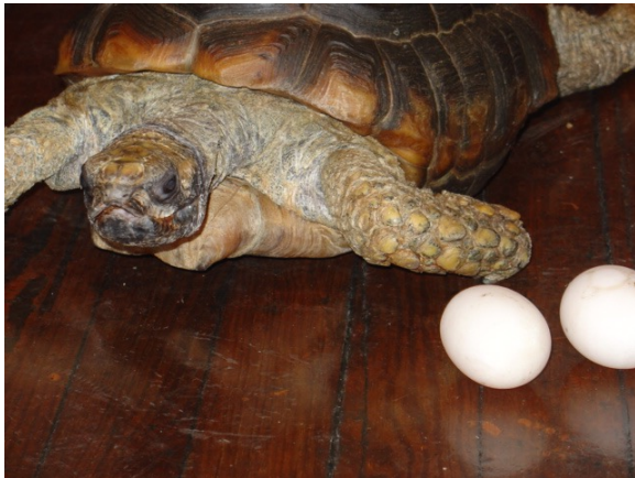
Rauschenberg’s turtle Rocky, with her eggs, in his Lafayette Street studio, New York, August 2006

many? How many you got? Two? Send them down. I want them gold-leafed.” I want them this, I want them that. It was just the coolest thing. But then the sad part was the [American] Museum of Natural History [New York] comes in and, “Oh my god, you guys are feeding this turtle this,” and, “You should be giving it this turtle food.” From what I understand—someone can correct me—but I think that she was one of the last of her species. They had talked about that, because we had talked about, “Well, can we get the egg? Can we have a little Rocky? Can we have baby Rocky?” Something about not being able to fertilize them or she was too old. And that’s what ended up killing her, an egg was lodged inside, from what I understand. And that was very sad. But that was just too funny. I just remember Bob, not only was he blown away by it, but it was a new art project. What can I do with these eggs?