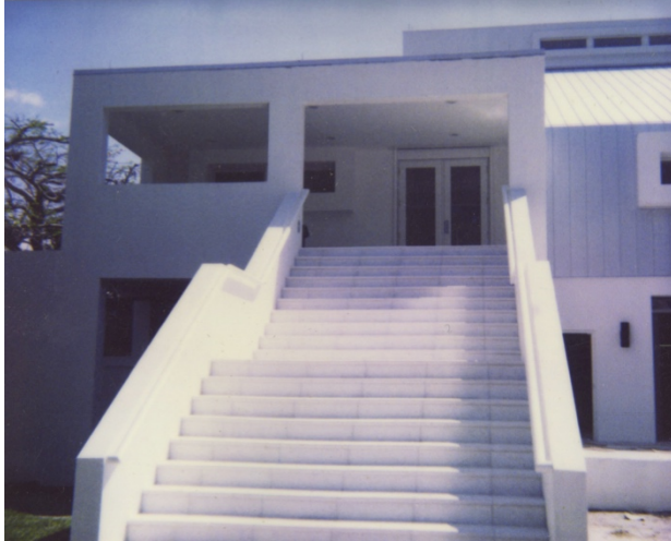
Exterior of Rauschenberg's Captiva Drive studio, ca. 1993.

ironic. Both his last home and his studio—I was at the beginning of that, so kind of always dated that way.