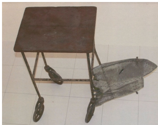
Dylaby relic, cart with wheels with crushed metal attachment, from Rauschenberg's installation for Dylaby at the Stedelijk Museum, Amsterdam (1962). Robert Rauschenberg Foundation

modified tables. Lawrence designed a table that could be tilted if he needed it. We just were positive, encouraging.