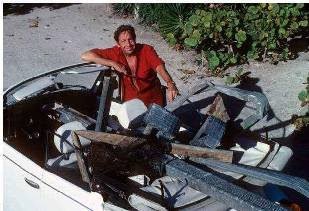
Rauschenberg returning to his studio in his Volkswagen Bug convertible after a run to the Gulf Iron and Metal Junkyard, a source of materials for his Kabal American Zephyr series, Captiva, Florida, 1982.

portion—these all started in the seventies, buying these pieces of property. The jungle portion, had he not bought it, today would have twenty-eight homes in it, maybe more. The unique thing about the road that's through there—he had two Volkswagens, This and That. He drove This through the jungle and wherever he made it through the jungle—have you been through that road yet back there?