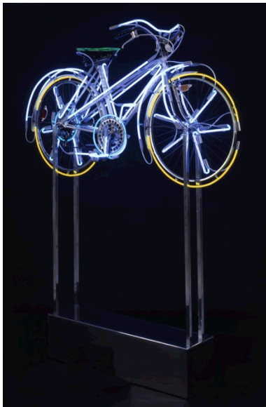
Robert Rauschenberg Bicycloid II , 1992 Bicycle with neon light and aluminum base 90 3/4 x 72 1/2 x 24 1/4 inches (230.5 x 184.2 x 61.6 cm) Robert Rauschenberg Foundation