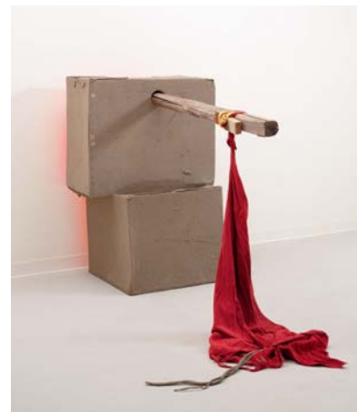
Robert Rauschenberg Untitled ( Early Egyptian ), 1973 Cardboard, sand, Day-Glo paint, wood, fabric, and fabric belt 54 1/4 x 35 x 78 inches (137.8 x 88.9 x 198.1 cm) Hess Art Collection, Switzerland