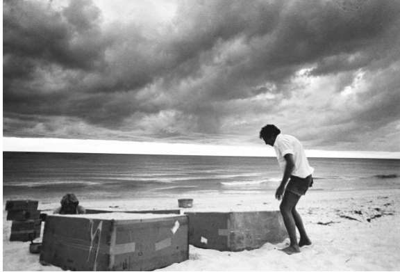
Rauschenberg and studio assistant adhering sand to Early Egyptian series (1973–74) on the beach, Captiva, Florida, ca. 1973. Photograph Collection. Robert Rauschenberg Foundation Archives, New York.

[1971–72] on the beach using Captiva sand. He did matte medium and then painted the backs of these boxes, just spectacular. [Note: describing Early Egyptian series, 1973–74]