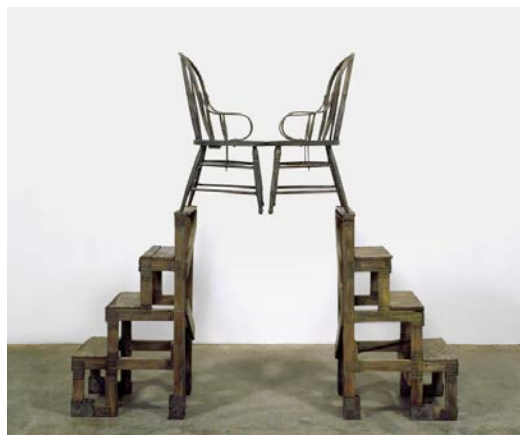
Robert Rauschenberg The Ancient Incident (Kabal American Zephyr) , 1981–2006 Patinated cast bronze 86 1/2 x 91 x 20 7/8 inches (219.7 x 231.1 x 53 cm) From an edition of 6 produced by Bronzart Foundry, Sarasota, Florida

thousand pieces of artwork. So that whole thing about his philosophy I think is my favorite. I would never want to say, “Oh, that one’s my ultimate favorite.”