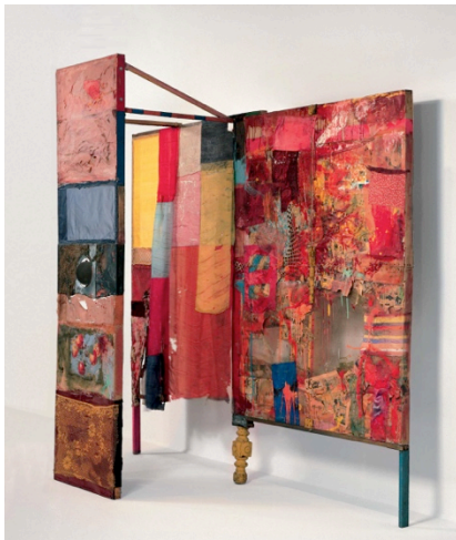
Robert Rauschenberg Minutiae, 1954 Combine: oil, paper, fabric, newspaper, wood, metal, and plastic with mirror on braided wire on wooded structure 84 1/2 x 81 x 30 1/2 inches (214.6 x 205.7 x 77.5 cm) Private collection