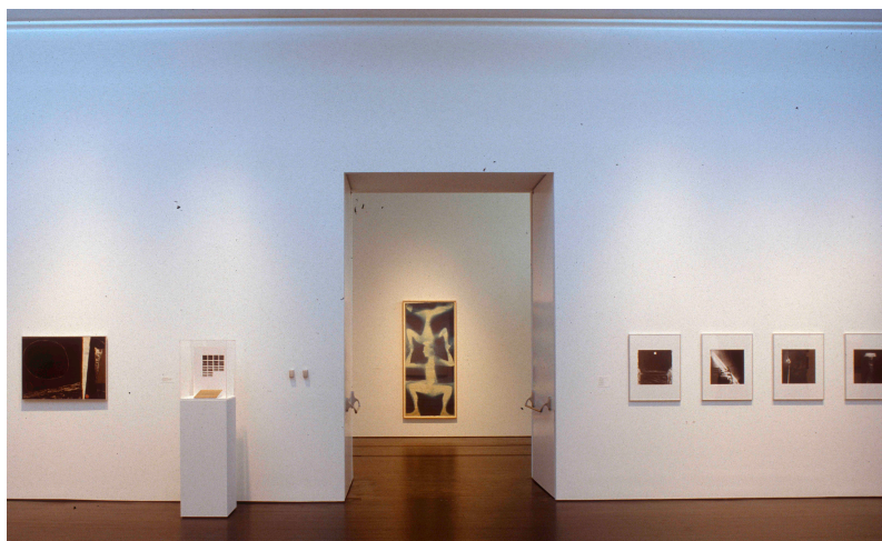
Installation view, Robert Rauschenberg: The Early 1950s, The Menil Collection, Houston, 1991–2.