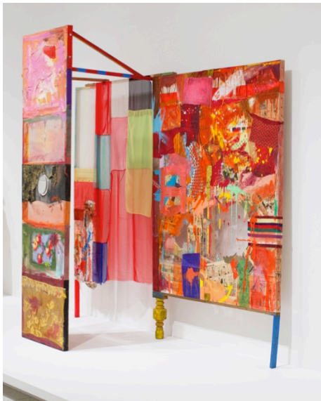
after Robert Rauschenberg Décor for Minutiae , 1976/1954 Combine: oil, paper, fabric, newspaper, wood, metal, plastic, with mirror on string, on wood structure 84 1/2 x 81 x 30 1/2 inches (214.6 x 205.7 x 77.5 cm) Walker Art Center, Minneapolis