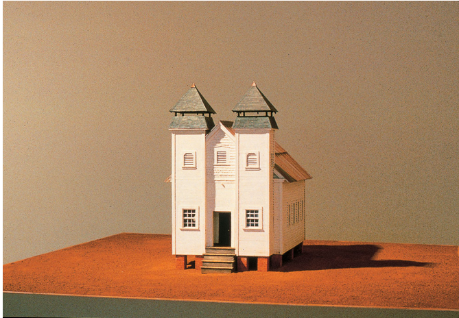
William Christenberry Church, Sprott, Alabama , 1974–5 Painted balsawood

Before I moved to Houston, he worked on an Yves Klein retrospective that they were showing and that had already been on the books and he really did a beautiful job with that [ Yves Klein 1928–1962: A Retrospective , Rice University, 1982]. I didn't know Klein's work at that point in time so it was a real learning experience for me. Then, oh god—well even with the Rauschenberg show, the early Rauschenberg [ Robert Rauschenberg: The Early 1950s ] and the one that went to Europe in the nineties [ Robert Rauschenberg: A Retrospective ], it was a completely different exhibition with every venue. Works were coming in and out, and new works were being added, but also the buildings were so different that it completely changed. So I really learned a lot about Bob's work and about the later work and realized that Bob was consistently innovative all along. A lot of the thing about the early work being really a breakthrough and the most important, well yes, it's fantastic, but so was the later work and it made me understand that.