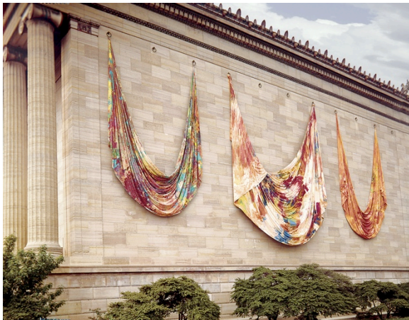
Installation view, Sam Gilliam's Seahorses (1975), Philadelphia Museum of Art, 1975