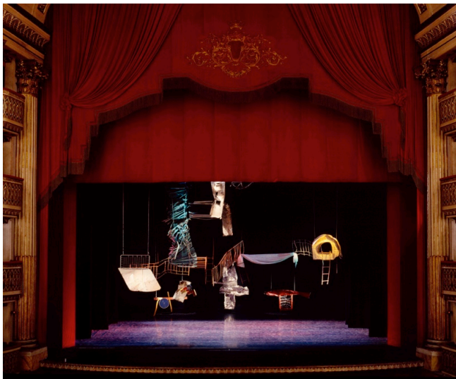
Set designed by Rauschenberg for Trisha Brown Dance Company's Lateral Pass (1985), Teatro di San Carlo, Naples, January 1987. Photograph Collection. Robert Rauschenberg Foundation Archives, New York.

put these things together; these to me are some of the most beautiful Rauschenbergs that exist, and they're just so spontaneous and they're just so beautiful. [Note: When the delivery of the original set designed by Nancy Graves for Trisha Brown's Lateral Pass (1985) was delayed for a 1987 performance in Naples, Rauschenberg created an emergency set from salvaged scrap metal, elements of which were then made into Neapolitan Gluts (all 1987)]