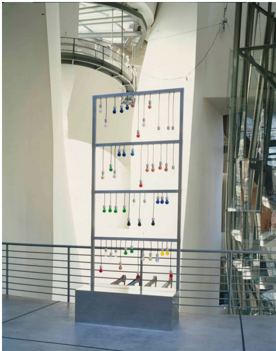
Installation view, Rauschenberg's Earth Pull (1998) in Robert Rauschenberg: A Retrospective, Guggenheim Museum, Bilbao, Spain, 1998–99.