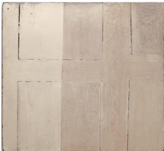
Robert Rauschenberg Crucifixion and Reflection , ca. 1950 Oil, enamel, water-based paint, and newspaper on paperboard attached to wood support 47 3/4 x 51 1/8 inches (121.3 x 129.9 cm) The Menil Collection, Houston