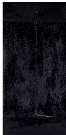
Robert Rauschenberg Untitled (Night Blooming) , 1951 Oil, asphaltum, and gravel on canvas 62 1/4 x 31 1/2 inches (158.1 x 80 cm) The Menil Collection, Houston