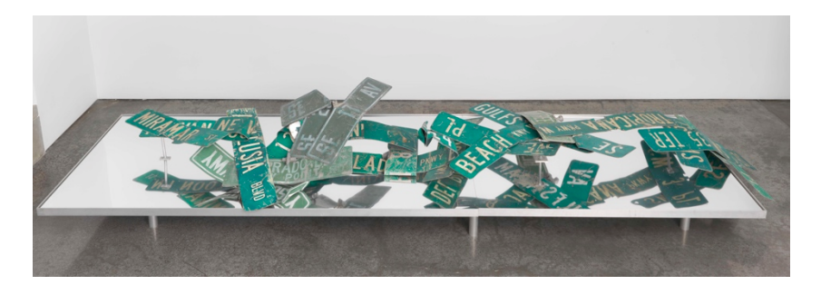
Robert Rauschenberg Urban Katydid (Glut) , 1986 Riveted metal parts and stainless steel 24 x 138 x 38 1/2 inches (61 x 350.5 x 97.8 cm) Robert Rauschenberg Foundation

on various precious metal surfaces, plus some sleepers hidden in there, license plates stuck on something, and saw, the guy's got it. What he had was a tremendous eye for how things fit into the world and how to dislocate them slightly so that they called attention to themselves in an aesthetic interval so that you could appreciate them in some sort of objective sense; represent them to yourself, which is what we do as spectators. I represent this thing to myself under some description. I've tried to recuperate it as best I can. Or I suspend my beliefs. Or I have no opinion about it whatever.