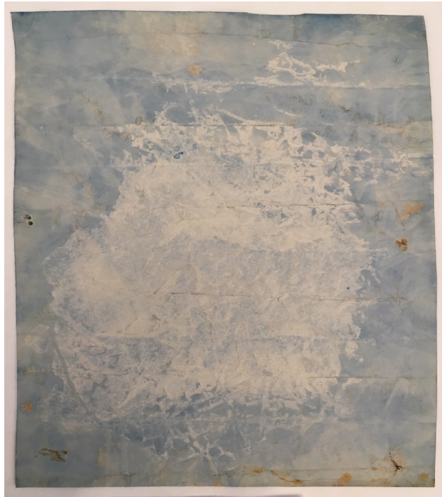
fig. 2 RRF# SC192 (verso).

Not quite a perfect square, SC192 is printed on a piece of exposed blueprint paper that is slightly taller than the overall width of the composition. The left and right sides of the page are cut along a moderately uneven line, intensifying the overall asymmetry of the work. It is unclear if the piece of blueprint paper—most likely mass-produced and standard sized—was cut before or after the composition was exposed. On the verso, the faded remains of a rectangular strip of tape are evident in the top right corner (fig. 2). This indicates that at some point SC192 was mounted, perhaps to a mat board or another material that was sturdier than paper. 5 Generally speaking, the sheet shows signs