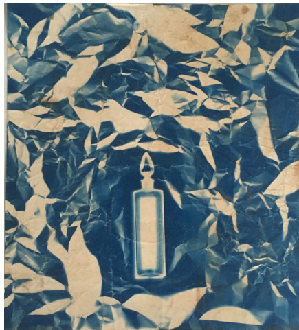
fig. 9 Attributed to Robert Rauschenberg, untitled blueprint, undated. Cyanotype, 10 3/4 x 9 3/8 inches (27.2 x 24.5 cm). Robert Rauschenberg Foundation, Study Collection, RRF# SC183.