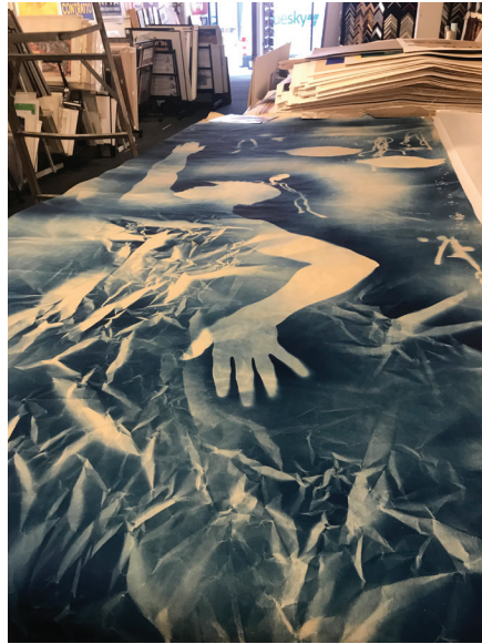
fig. 8 Matson Jones, cyanotype for department-store window display, ca. 1955 (detail, one panel).