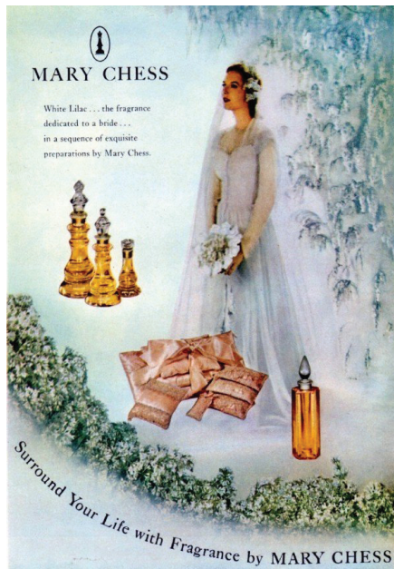
fig. 10 Advertisement for Mary Chess Perfume, featuring "Star Bottle," in bottom right corner, ca. 1947.

In addition to SC192, one other blueprint in the Study Collection features the crumpled paper motif (fig. 9). Referred to as RRF# SC183, the work also pictures the imprint of a perfume bottle. The bottle appears to be a near perfect match to the star bottle that was made by perfumer Mary Chess and produced between 1942 and 1956 (fig. 10). 24 The perfume was primarily sold at luxury department stores and retailed between $5 and $7.50. It is unclear where the bottle came from, but given Rauschenberg's window display work, it is possible he acquired it through his work at Bonwit Teller. There is evidence to suggest that Bonwit Teller did feature Mary Chess-themed display windows, such as a display installed from June 27 to July 11, 1950, and documented in the Dan Arje papers at The New School. 25 However, no extant photographs of Bonwit Teller windows feature SC183, so it is unknown if the print was ever featured in a display.