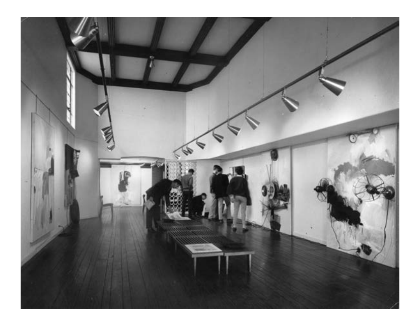
Installation view, Robert Rauschenberg, Dwan Gallery, Los Angeles, 1962, with gallery visitors interacting with Rauschenberg's Black Market (1961). Photograph Collection. Robert Rauschenberg Foundation Archives, New York.