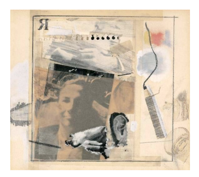
Robert Rauschenberg Untitled [self-portrait for Dwan poster], 1965 Solvent transfer, ink, graphite, paper, and tape on paper 8 x 9 inches (20.3 x 22.9 cm)

We had a show of relatively small drawings. What were they? I suppose 16-by-20 [inches] and then a couple of larger drawings and then one canvas. One large canvas, which was—I don't remember very well, but it was a—