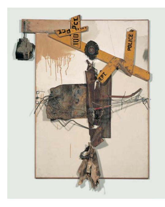
Robert Rauschenberg Coexistence , 1961 Combine: oil on canvas with fabric, wood, metal, and wire 66 3/4 x 49 7/8 x 14 1/4 inches (169.5 x 126.7 x 36.2 cm) Virginia Museum of Fine Arts Gift of the Sydney and Frances Lewis Foundation Exhibited in My Country 'Tis of Thee , Dwan Gallery, Los Angeles, 1962

Dwan: His work involved things that were at hand in America at that time and particularly in New York. And I found that art that was based on using—certainly I knew about the whole collage, montage, and so forth—but his work was particularly strong in expressing Americanism and the American or New York way of life. I think actually that Americanism was really a big force for a short time there. It changed, I believe, but I even did a show called My Country 'Tis of Thee [1962], which involved quite a few of the Pop art people and some other works as well because there was a sense of—against the old way and "Let's start with the new" and certainly Bob personified that. He also had an unerring sense of proportion and shape. He knew how to put objects together in a way that was always wonderful and even with objects that were not wonderful in themselves at all. I felt exhilarated by his work.