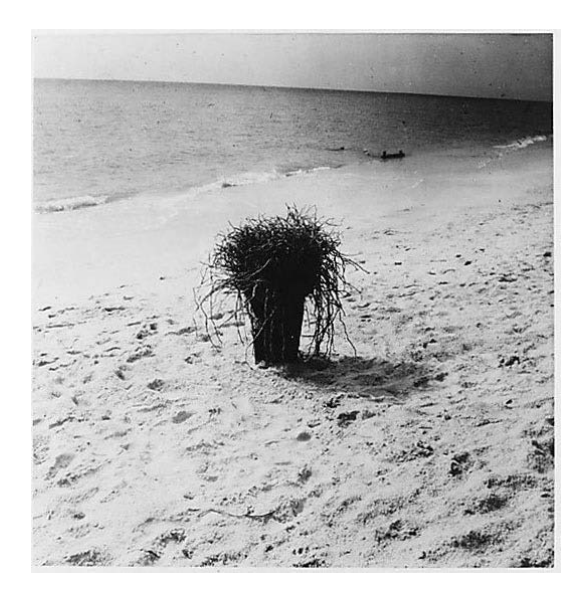
Virginia Dwan Second Upside-Down Tree, 1969 Photograph of ephemeral work by Robert Smithson Gelatin silver print 7 9/16 x 7 9/16 inches (19.2 x 19.2 cm)