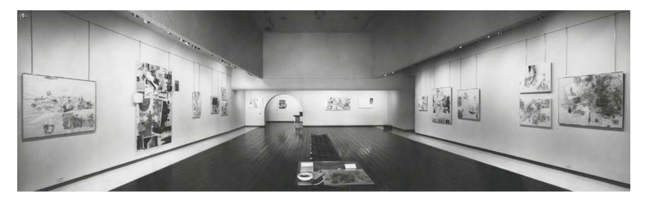
Installation view, Rauschenberg at Dwan , Dwan Gallery, Los Angeles, 1965.

Robert Rauschenberg Mainspring, 1965 Solvent transfer on paper with pencil, watercolor, gouache, cardboard, and tape 32 x 62 1/2 inches (81.3 x 158.8 cm) Private collection Exhibited in Rauschenberg at Dwan, Dwan Gallery, Los Angeles, 1965