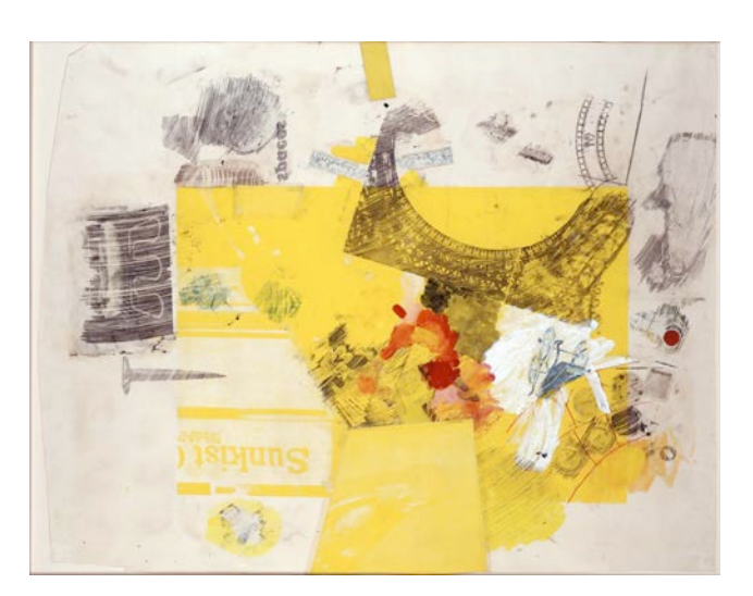
Robert Rauschenberg Promise , 1965 Solvent transfer on paper with silkscreen ink 31 x 39 inches (78.7 x 99.1 cm) Private collection Exhibited in Rauschenberg at Dwan , Dwan Gallery, Los Angeles, 1965

Robert Rauschenberg Umpire, 1965 Solvent transfer on paper with silkscreen ink and printed reproductions 35 x 31 inches (88.9 x 78.7 cm) Private collection Exhibited in Rauschenberg at Dwan , Dwan Gallery, Los Angeles, 1965