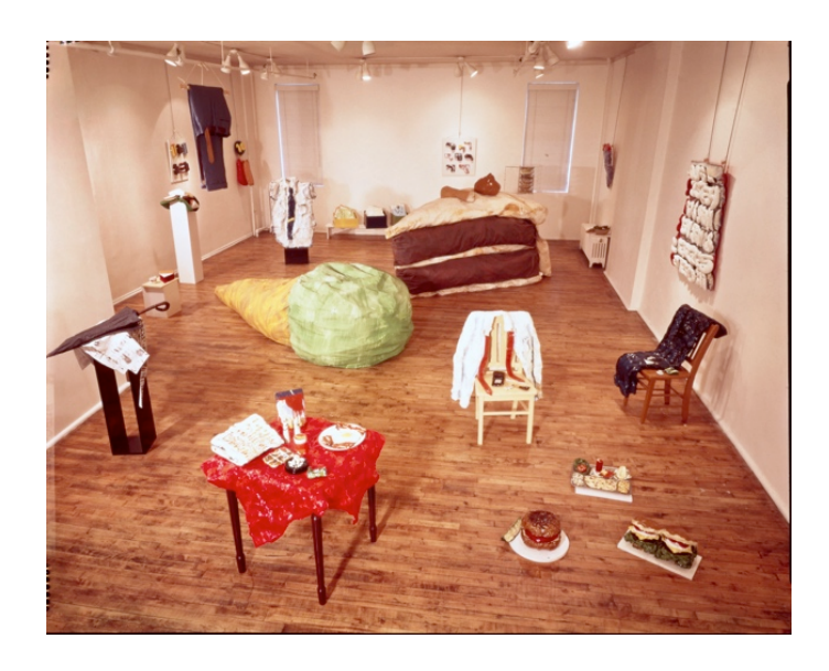
Installation view, Claes Oldenburg , Green Gallery, New York, 1962.

You know how the sewing machines are. They have this little space where the cloth can go through. It's completely insane. Those three pieces were made sitting on the floor [Floor Burger, Floor Cake, and Floor Cone]. A lot of the other pieces too.