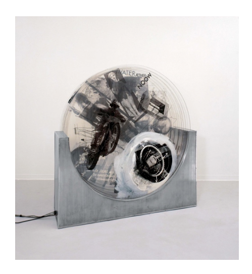
Robert Rauschenberg Revolver VI, 1967 Silkscreen ink on five rotating Plexiglas discs in metal base, with electric motors and control box 78 x 77 x 24 1/2 inches (198.1 x 195.6 x 62.2 cm) Robert Rauschenberg Foundation