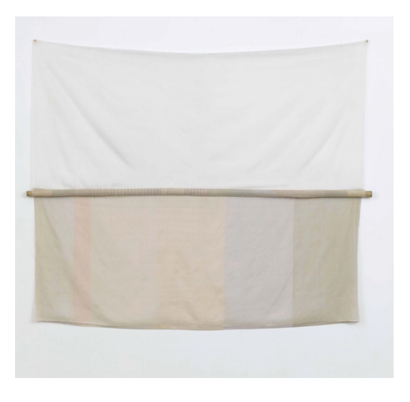
Robert Rauschenberg Snowpool (Jammer), 1976 Sewn fabric and cloth-covered rattan pole 73 x 90 x 1 1/2 inches (185.4 x 228.6 x 3.8 cm) Robert Rauschenberg Foundation