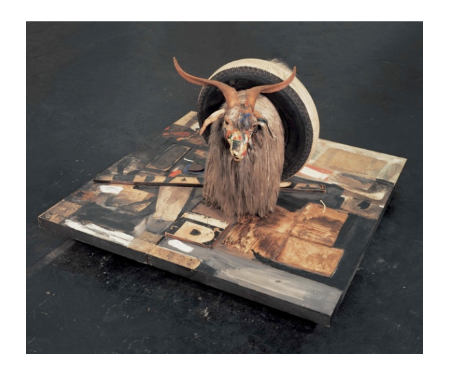
Robert Rauschenberg Monogram , 1955–59 Combine: oil, paper, fabric, printed paper, printed reproductions, metal, wood, rubber shoe heel, and tennis ball on canvas with oil and rubber tire on Angora goat on wood platform mounted on four casters

42 x 63 1/4 x 64 1/2 inches (106.7 x 160.7 x 163.8 cm)