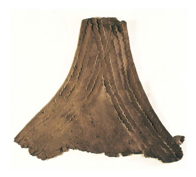
Robert Rauschenberg Realm (Tracks) , 1976 Cast dirt with resin binder, fiberglass and wet soil patina 36 3/4 x 30 1/4 inches (93.3 x 76.8 cm) From an edition of 18, produced by Pyramid Arts, Ltd., Tampa