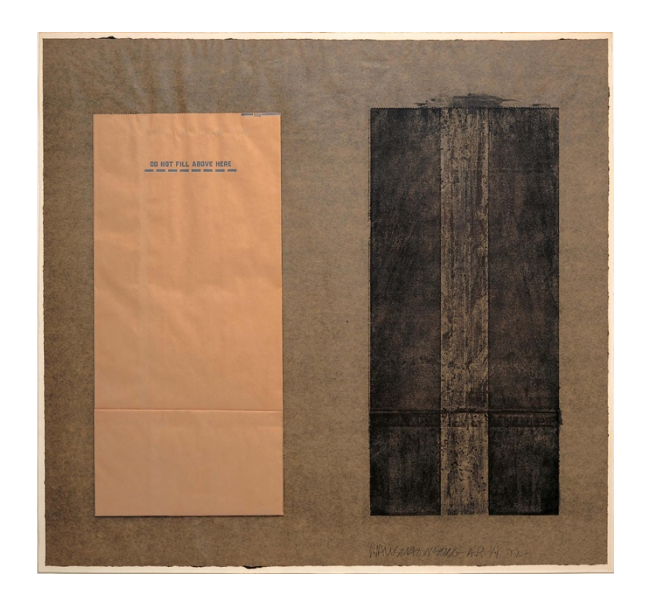
Robert Rauschenberg Tampa 3 , 1972 Lithograph with collage and graphite 43 7/8 x 47 x 1/4 inches (111.4 x 119.4 x .6 cm) From an edition of 20 Arabic numerals and 20 Roman numerals, published by Graphicstudio, University of South Florida, Tampa