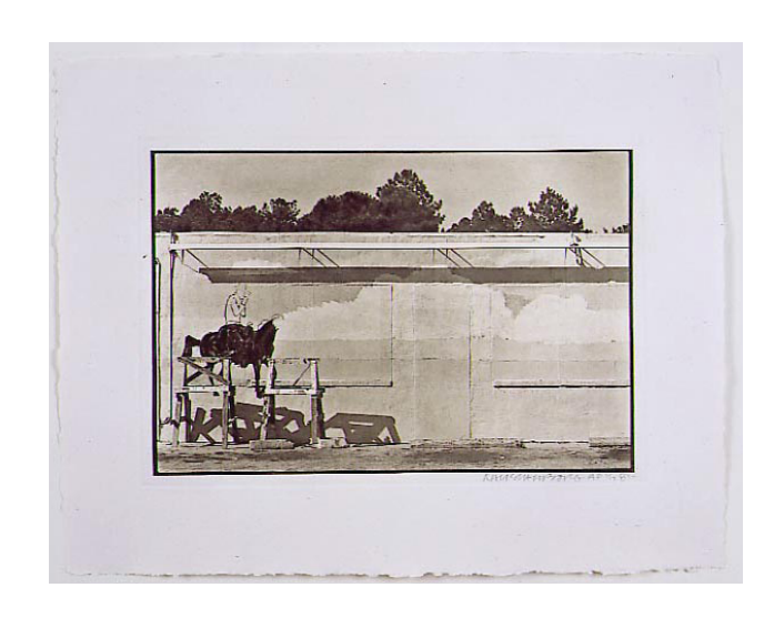
Robert Rauschenberg Horse from Photogravures–Suite 1 ( America Mix-16 ), 1983 From a portfolio of 16 photogravures 20 1/2 x 26 1/2 inches (52.1 x 67.3 cm) each, horizontal and vertical From an edition of 40 published by Iris Editions

He was always excited about doing these. Because he presented me with actually photographic prints, what I had to do was re-photograph them, make a negative on film, and then contact that onto another piece of film to make a positive, which I did in my studio in New York. It was on 399 Washington Street. When I started working on this I thought—I established a company called Iris Editions.