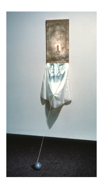
Robert Rauschenberg Fifth Force , 1986 Bronze, acrylic paint, Xerox transfer on silk, waxed thread, painted shot with stainless steel pin 83 1/4 x 15 x 45 inches (211.5 x 38.1 x 114.3 cm) From an edition of 25 published by Graphicstudio, University of South Florida, Tampa; only 12 realized

So that's why that is vertical. And then these two images on the silk of Galileo facing each other, we ran that through the press with, I think, Xerox prints; we put the silk down, put a piece of newspaper, and used a solvent on the back, ran it through the press with the solvent, then dissolved the ink, and then the ink came off onto the silk. The cannonballs were actually shot puts. They had impressed in the shot put, ten pounds or twenty pounds, whatever they were. So we had to get rid of any paint or anything on there and fill it in with epoxy, so it became totally round, so you didn't see that it was a shot put. It became a cannonball, see?