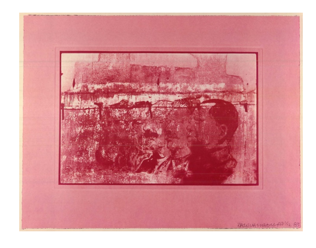
Robert Rauschenberg Two untitled prints from Photogravures—Suite 2 (China Mix-21) , 1983 From a portfolio of 21 photogravures 26 1/4 x 20 1/2 inches (66.7 x 52.1 cm) each, horizontal and vertical From an edition of 40 published by Iris Editions